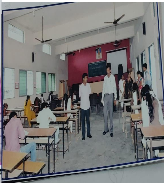
Ozone Day Program 19 September 2019