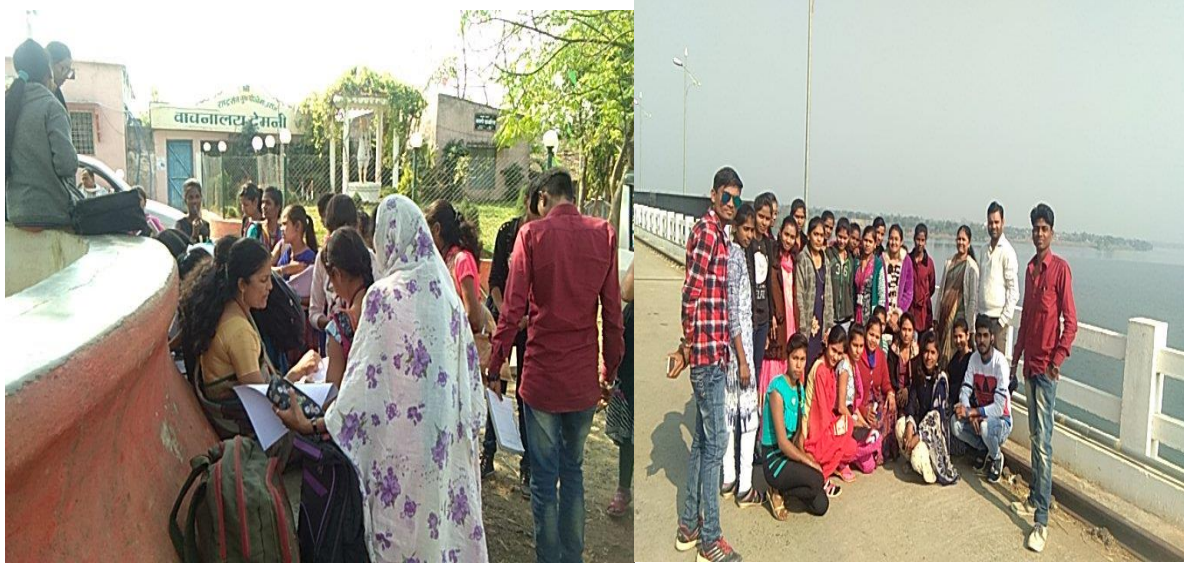
Socio-Economic survey Saharwani 2 Feb. 2020